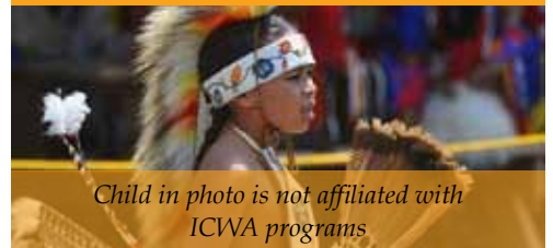
Child in photo is not affiliated with ICWA programs

The Mashpee Wampanoag Tribe Indian Child Welfare Act (ICWA) Department is looking for Tribal Members that are interested in becoming a foster parent. The ICWA Department is in desperate need of individuals to step forward and give our next generation the warm, loving and safe home they deserve.