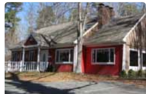
The Flume Restaurant