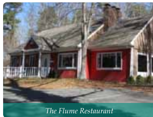
The Flume Restaurant