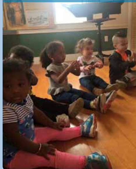
Preschoolers sing the "Kuwâmônush" (I Love You) song at the Tribal Museum