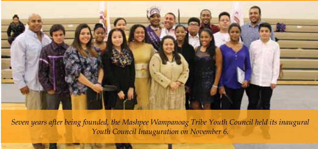
Seven years after being founded, the Mashpee Wampanoag Tribe Youth Council held its inaugural Youth Council Inauguration on November 6.