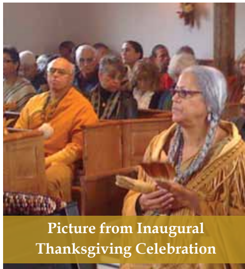
Picture from Inaugural Thanksgiving Celebration

Our Native American Thanksgiving is being hosted by The Old Indian Meeting House Committee. Please join us as “we gather together” to give thanks.