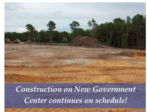
Construction on New Government Center continues on schedule!