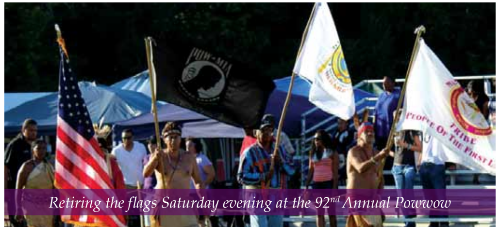
Retiring the flags Saturday evening at the 92 nd Annual Powwow