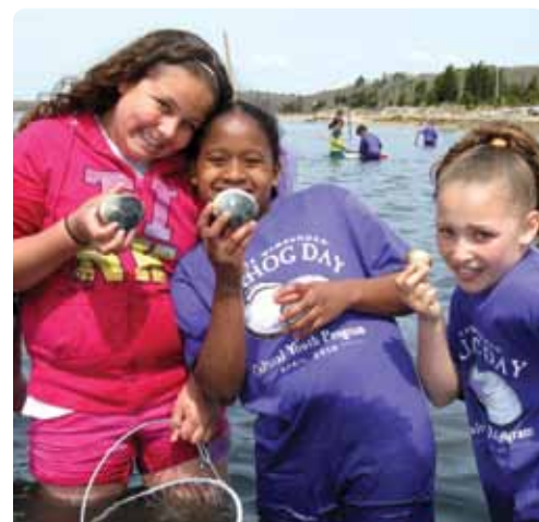
Photo from 1 st Annual Quahog Day

Every year, Quahog Day offers our youth the chance to learn about the Wampanoag shell fishing tradition, including proper harvesting techniques and care for the natural environment. The kids also learn how to prepare Quahogs for eating and about the many traditional uses for Quahog shells. When the fishing is done, a family cook out for all participants will be held on the Community and Government Center field. The event is fun for kids of all ages, and a great opportunity for families to connect with Wampanoag culture.