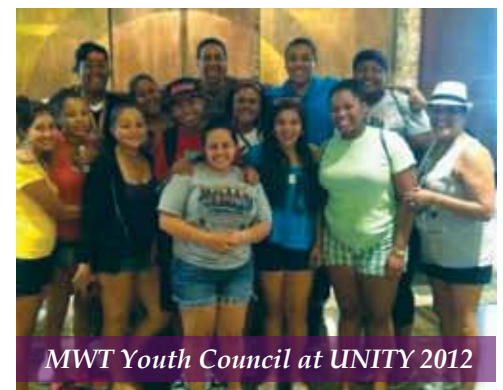
MWT Youth Council at UNITY 2012