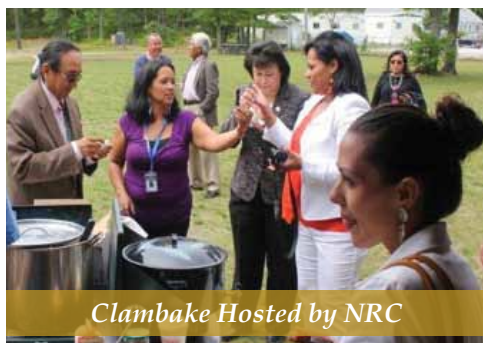
Clambake Hosted by NRC

In between meetings, we hosted an afternoon of activities for our guests that included a tour of the historical and social places of our people, including the Indian Museum, the herring run, the Old Indian Meeting House and cemetery, Tribal Headquarters, local artisans shops, the beautiful shorelines and bays, Plimoth Plantation and an extraordinary traditional clambake provided by our Natural Resource Commission.