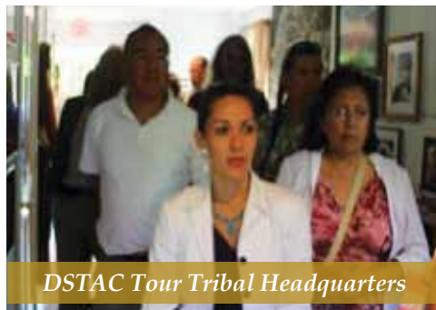
DSTAC Tour Tribal Headquarters