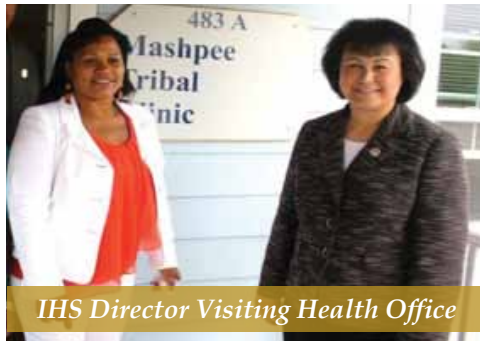
IHS Director Visiting Health Office

The DSTAC is comprised of Tribal Leaders from the Aberdeen, Al-